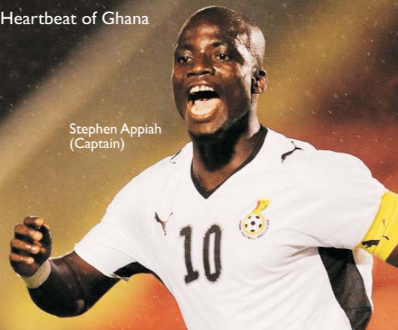
Stephen Appiah (Captain)