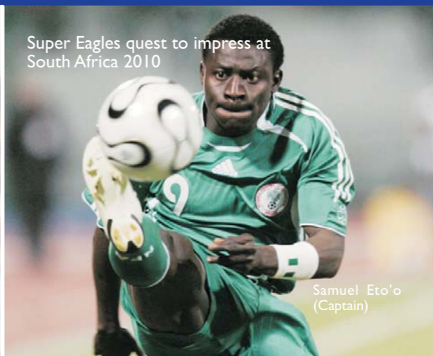
Samuel Eto'o (Captain)